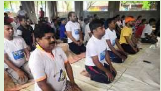
YOGA DAY CELEBRATION