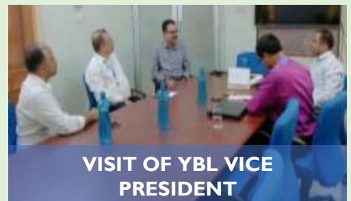
VISIT OF YBL VICE PRESIDENT